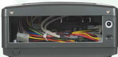
Rear Side Panel