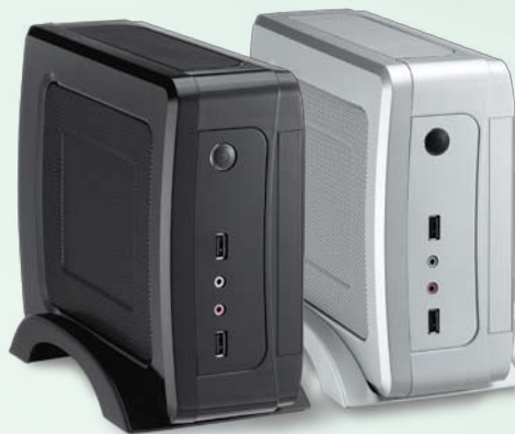
Rear Side Panel