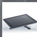
Rotatable and detachable display: Literally more freedom for your ideas.