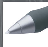
Grip Pen: Digital fashion designs as if they were on paper, from first sketches to the finished article.

And that gives you even more freedom to create.