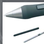
Switchable pen nibs: Stroke Pen and Felt Pen for the simulation of different effects with pressure sensitive tools.