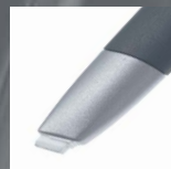
Art Marker: The superior digital alternative to conventional markers.

And if you want even more flexibility when illustrating your ideas, simply remove the display from its stand and place it on your lap.