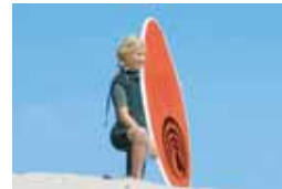
55mm (Equivalent to 85mm)