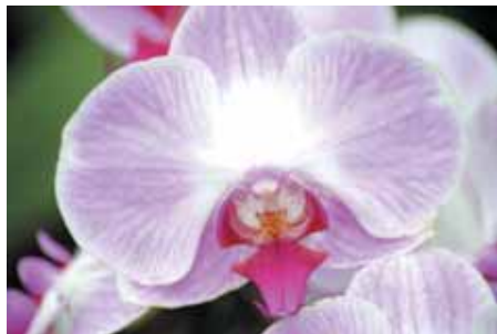
200mm (Equivalent to 310mm) Exposure: Aperture fully opened Auto ISO100 MFD: 0.95m Maximum Magnification Ratio: 1:3.5

*The MMR of 1:3.5 is equivalent to 1:2.3 on a 35mm camera.