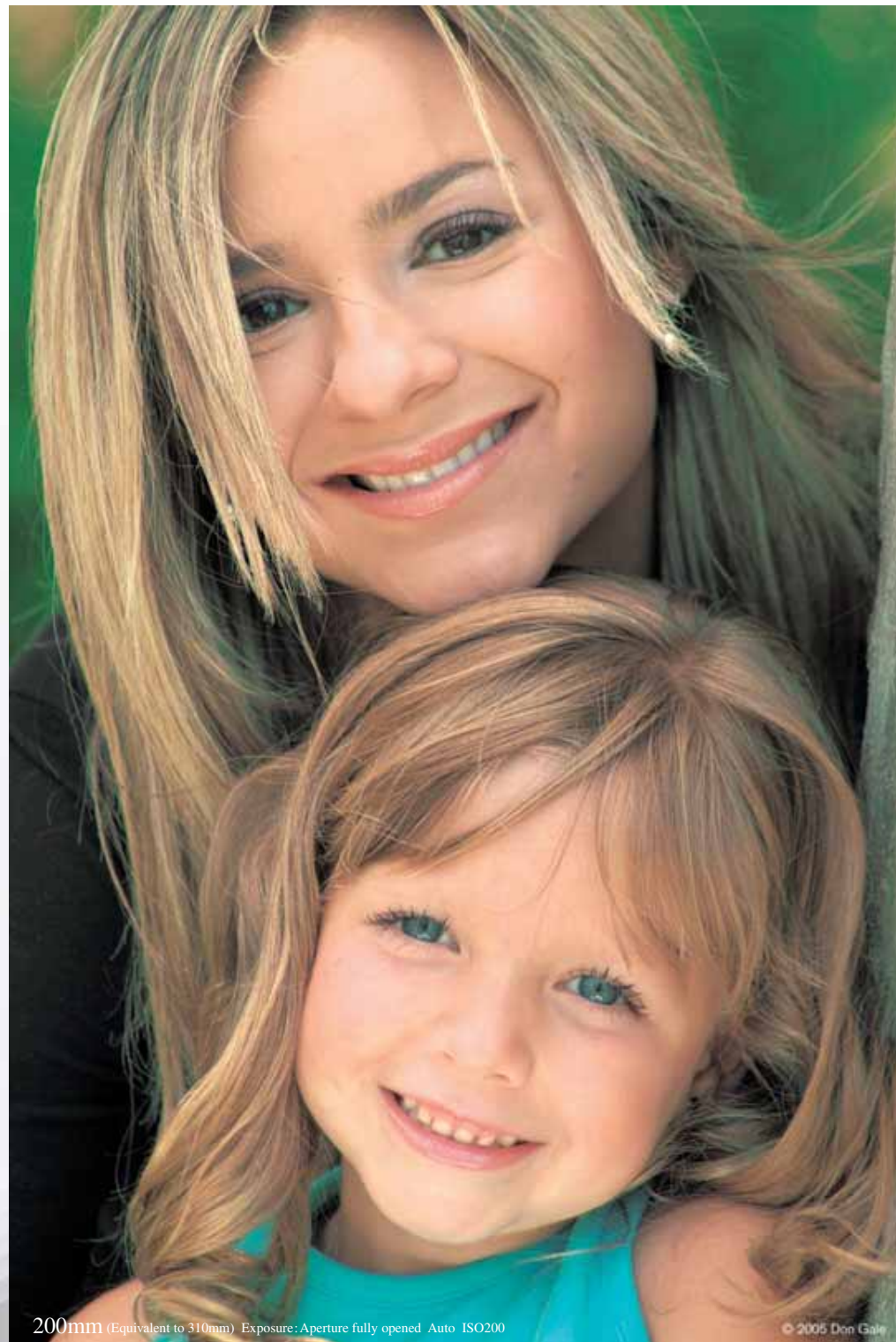
200mm (Equivalent to 310mm) Exposure: Aperture fully opened Auto ISO200