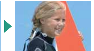
200mm (Equivalent to 310mm)