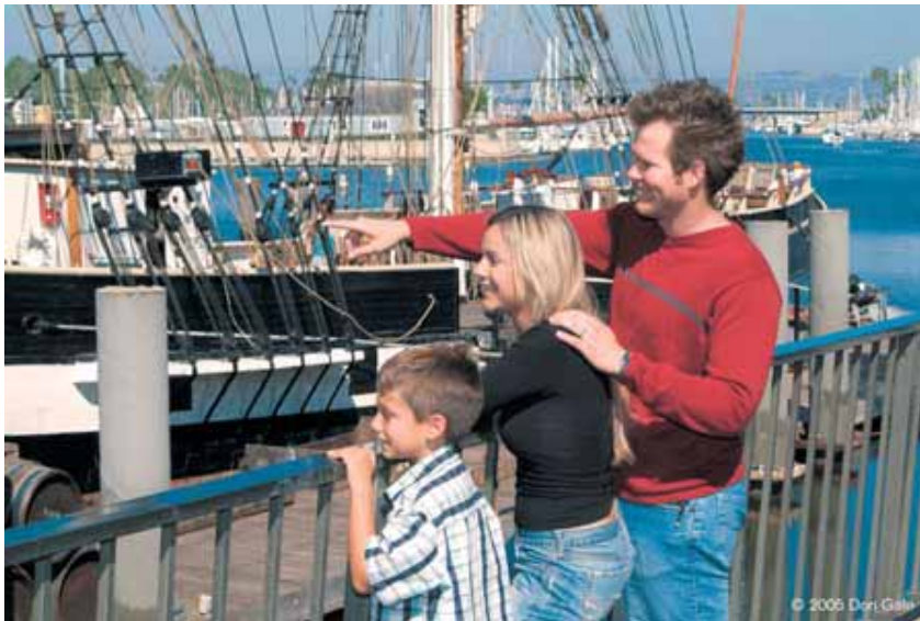
55mm (Equivalent to 85mm) Exposure: F/16 Auto ISO100