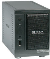
Convenient, small size for desktop use (~ 6 x 4 x 9 in)